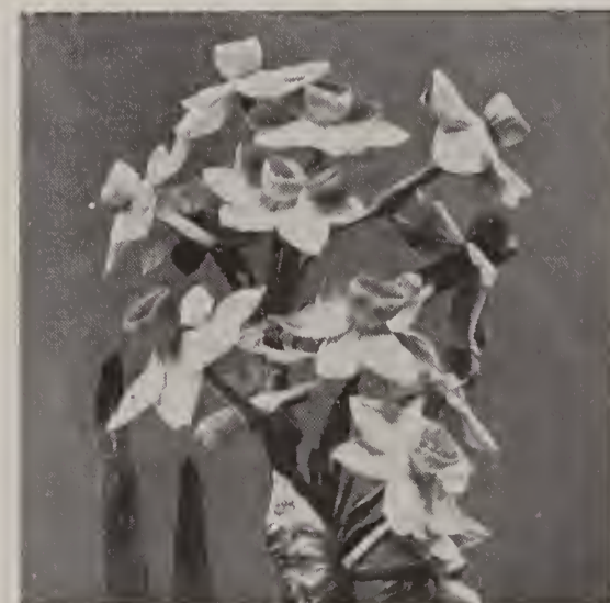
Narcissus, Jonquilla Simplex

All bulbs offered on this page are delivered free east of the Mississippi